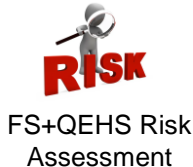
FS+QEHS Risk Assessment